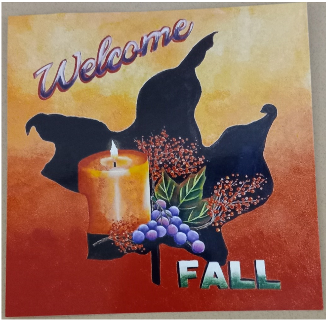
Welcome Fall Taught by Alise Duerr September 9, 2023